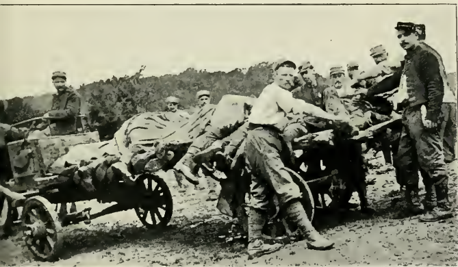
CARRYING DOWN THE DEAD AFTER THE ATTACK